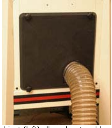
Locating the motor fully within the cabinet (left) allowed us to add effective dust collection in the form of a special cabinet floor and this rear cover (right) featuring a molded in 4" hose connection.

An additional benefit of locating the motor within the cabinet was clearing the way for the addition of an effective dust collection system to the JET ProShop 10" Table Saw. The rear dust cover (with an integral 4" dust collector hose connection) is secured by four finger knobs, making access to the cabinet for maintenance quick and tool free.